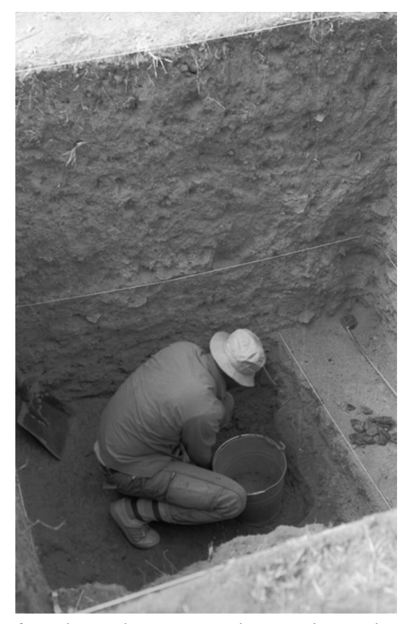
*Figure 9. The test pit seen from the north. James Ameje, squatting on the surface of layer 3, completes excavation of level 10.