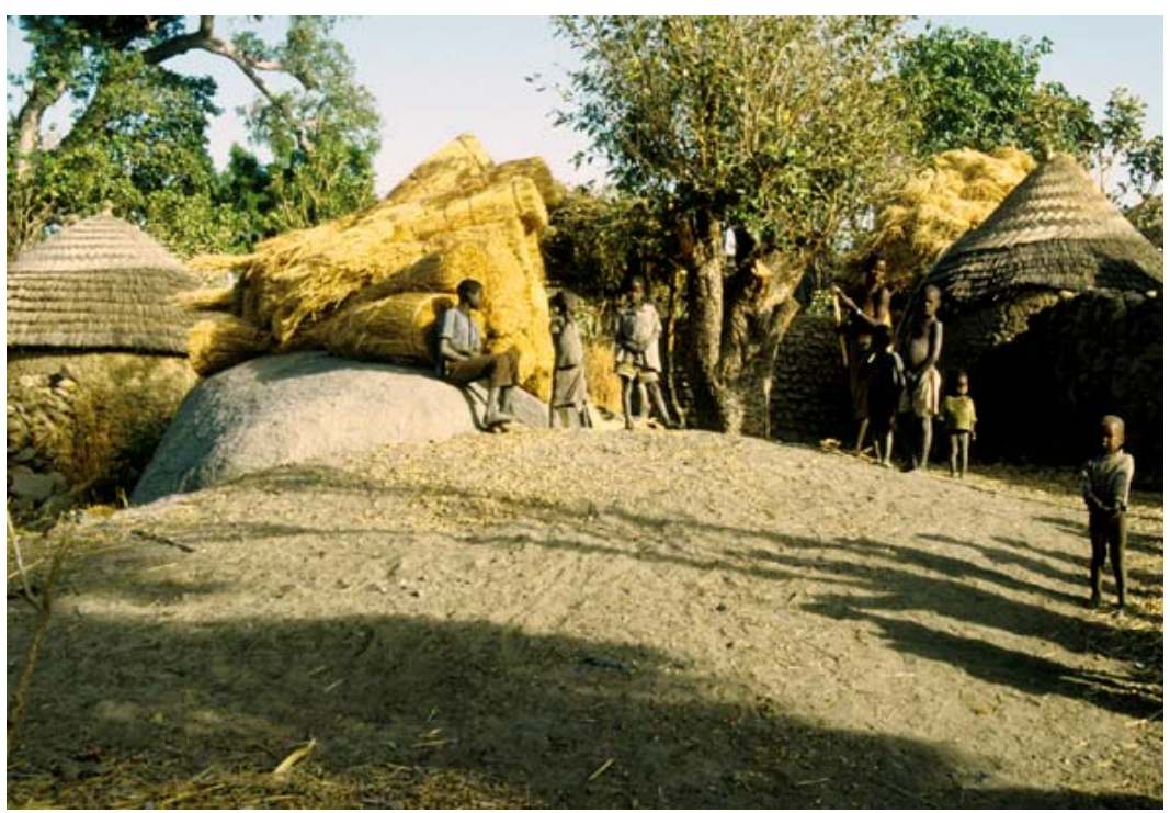
*Figure 1. A midden in Midalla ward, Jan. 1993.