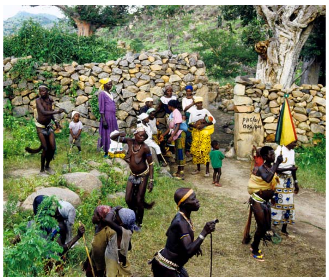
*Figure 31. Women dancing outside the southwest gateway of the Hidi House at Mbər, the men's initiation ceremony, wearing traditional costume that includes a belt of cowries, Aug. 1992.