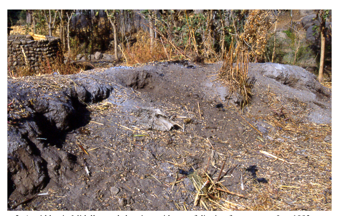
*Figure 2. A midden in Midalla ward showing evidence of digging for compost, Jan. 1993.