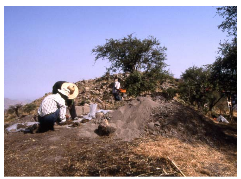
*Figure 7. Excavation of the Hidi Midden with sorting of finds and sieving in progress. View from the south with Muzi hill in the background.