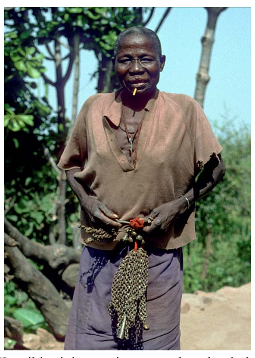
*Figure 30. Sukur woman of Kapsiki origin wearing a wooden plug in lower lip and modeling a girl's chain apron, Sept. 1992.