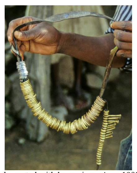
*Figure 29. Sukur woman's belt decorated with brass rings, Aug. 1992.