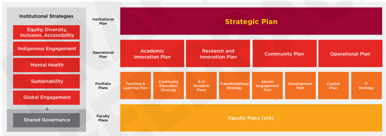
Figure A. The implementation plans are four of many plans at the University of Calgary. Collectively, these plans define our academic, research and operational environment, as well as our connections to the broader community.

Implementation plans for Ahead of Tomorrow are written by the responsible University Vice-Presidents using the IECB model of strategic planning. These plans provide additional detail and context necessary to deliver on the University’s approved Strategic Plan.