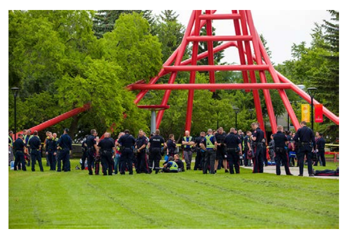
PHOTO: MEMBERS OF CPS, AHS & EMS, CFD, CAMPUS SECURITY AND UNIVERSITY VOLUNTEERS

The exercise took place in the Olympic Oval and Kinesiology B, with 150 emergency responders and the support of more than 150 campus community volunteers.