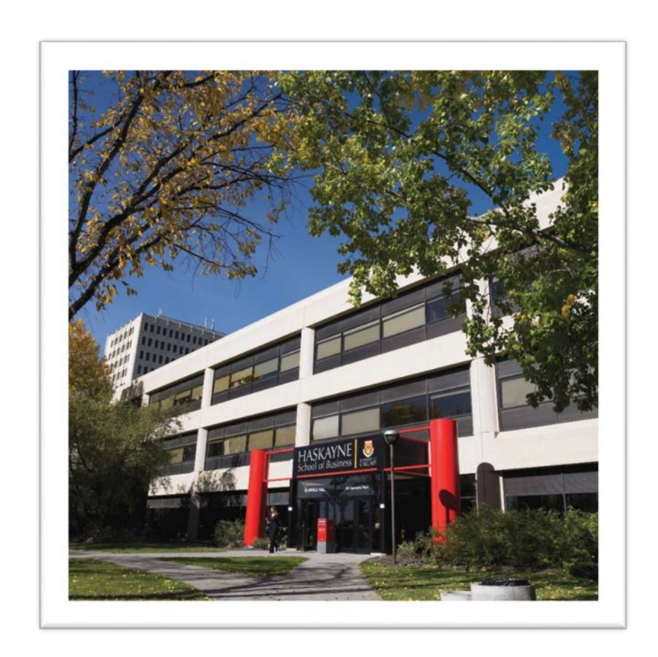
27 September 2018