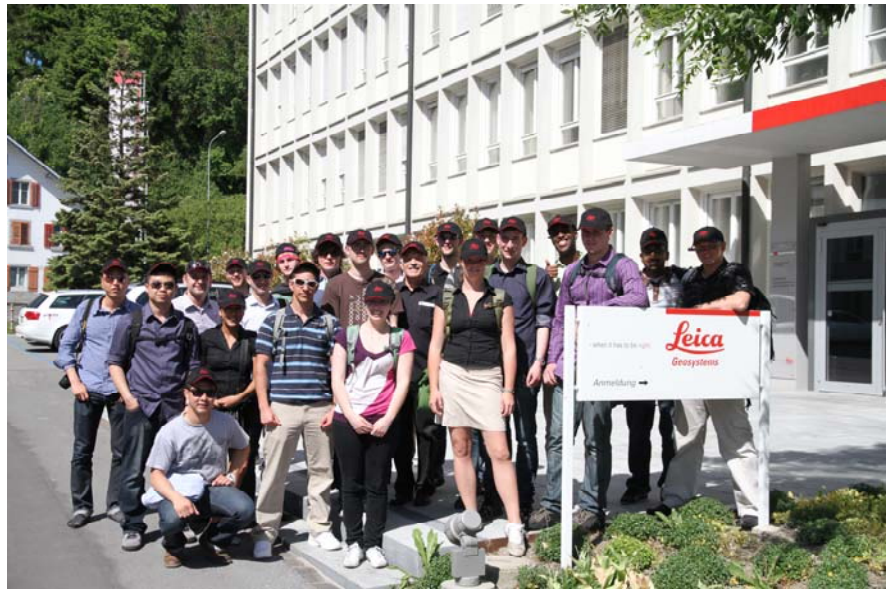
Switzerland Trip with Geomatics Undergrads