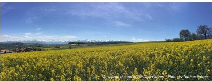
View from the top of the Observatory

We were greeted by Elmar Brockmann, who is head of "Geodetic Bases and Permanent Networks" at swisstopo, and he very graciously gave us a tour and history of the facility. With the sun still shining down on us at the end of the day we were treated to the amazing site of the observatory opening up on our inside and out tour of the telescope on top of Zimmerwald. Many a pictures was taken atop the observatory, which situated in a pasture, gave a picturesque view of the alps that many tourists probably never get to see. A truly spectacular way to spend time at the only stop in Bern.