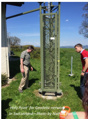
"Holy Point" for Geodetic network in Switzerland

Geostation. The scenic hilltop above Bern is where ZIMLAT (a one meter Laser and Astrometric Telescope) is positioned neighboring the alps. The Zimmerwald observatory is also where the reference point for the Swiss National Survey (LV95).