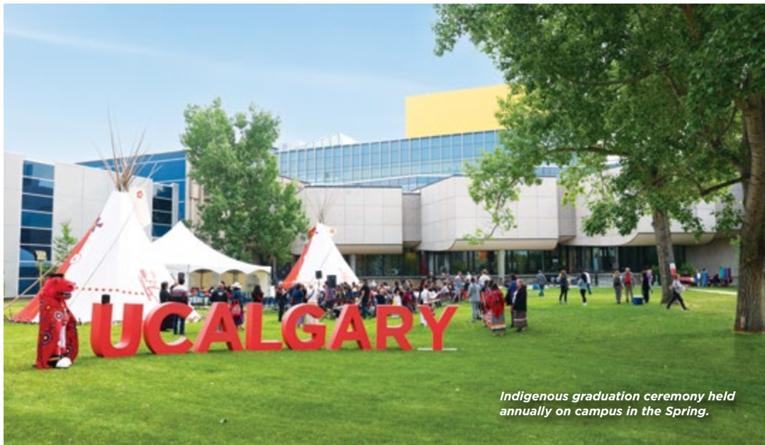
Indigenous graduation ceremony held annually on campus in the Spring.

The Siksikaitsitapi Medicine Wheel located in Nose Hill Park